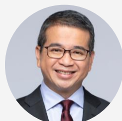
Edwin Tong SC Minister for Culture, Community and Youth, and Second Minister for Law, Singapore

"More IP is being filed and moved across borders than ever before as innovation, tech and digitalization increasingly drive global economic growth. But this also means that there has been a big increase in national and cross-border IP disputes.