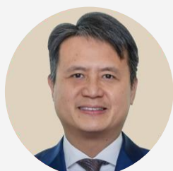
Daren Tang Director General, World Intellectual Property Organization (WIPO)