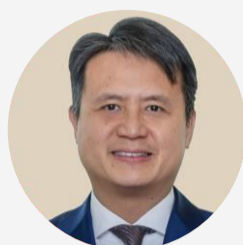
Daren Tang Director General, World Intellectual Property Organization (WIPO)