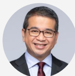
Edwin Tong SC Minister for Culture, Community and Youth, and Second Minister for Law, Singapore

How is dispute resolution shaping, and being shaped by, the development trajectory of frontier technologies? Join us to hear what global IP leaders and legal experts from the US and Singapore are saying about tech, IP, and dispute resolution. Don't miss insights on emerging trends, best practices and insights related to AI, Standard Essential Patents, Non-Fungible Tokens, cryptocurrency, and many more.